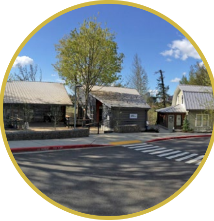
Mercer Slough Environmental Education Center 425-452-2565 1625 118 Avenue SE