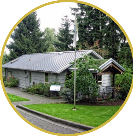
Lake Hills Greenbelt Ranger Station 425-452-6993 15416 SE 16 Street (15500 SE 16 Street: Parking Location)