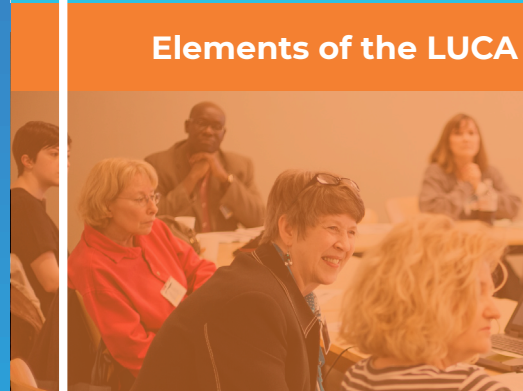
Elements of the LUCA