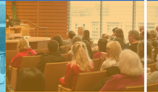
LUCA Survey Results